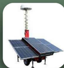
Mobile Solar Radar Station