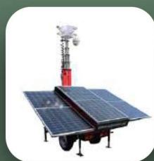
Mobile Solar surveillance