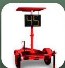
Mobile Solar Traffic Sign