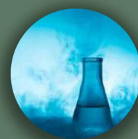
Conventional batteries store Energy Electro Chemically