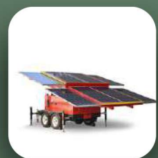
Mobile Solar Generator System